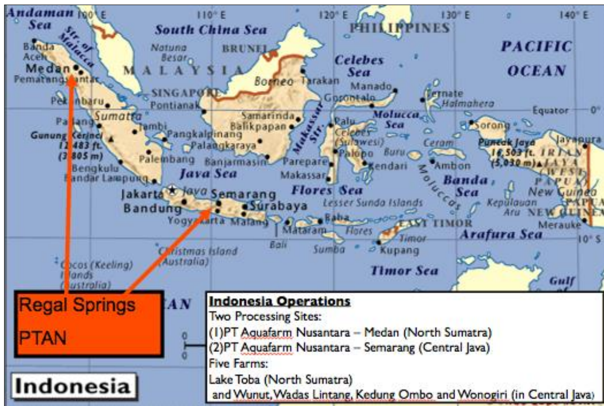
Figure 2: PT Aquafarm Nusantara tilapia aquaculture operations in Indonesia.

Tilapia produced for export is raised mainly in net pens in lakes or reservoirs (100-1,500 m 3 net pens) (Pelletier and Tyedmers 2010; Oakley 2015). PT Aquafarm Nusantara began farming in Indonesia in 1988 in Central Java. Initially, production was targeted at local markets, but international markets were needed to keep up with production growth as farming operations expanded. PT Aquafarm Nusantara owns and operates hatchery, growout, and processing facilities, enabling full control over all stages of tilapia growth and product preparation. PT Aquafarm Nusantara farms are located in public bodies of water: Lake Toba (North Sumatra) and Wunut, Wadas Lintang, Kedung Ombo and Wonogiri (in Central Java) (Huillery pers. comm. 2014).