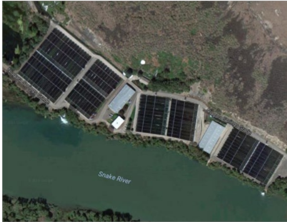
Figure 6: Aerial image of a large trout farm in the Hagerman Valley, Idaho. Note the discharges (whitewater) into the Snake River, whereas the raceways are surrounded by concrete.

Not all waterways used for production of trout are prone to the levels of flooding that would allow escapes, so the threat is not equal for all facilities. In Twin Falls County, Idaho, flooding is ranked as a “medium” hazard that happens to some extent every 1 to 2 years, and it can be incited by natural activity (e.g., heavy rainfall, snowmelt, ice jams) or human activity (e.g., dam, canal, or levee failure; clearing vegetation), but it is most often caused by spring snowmelt (TFC 2020). Several Idaho trout farms are close to the boundary of the 100-year floodplain of the Snake River, although no county-specific discussion to the threat to any commercial industries (aquaculture or other) is made in the Hazard Mitigation Plan (TFC 2020), suggesting minimal risk. The severity of flooding can be variable, based on factors like topography, soils, and vegetation; depth, rate, and velocity of water; and the construction of developed areas (TFC 2020). The county estimates that, “based on past events, the probability that significant flooding will occur in a given year is 30% and can be expected to occur every 3.3 years” (TFC 2020). That said, no large escape events from Idaho raceways have been documented publicly, and a large proportion of U.S. trout farms have been evaluated to be in areas not prone to flooding.