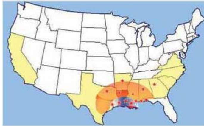
Figure 3: Distribution of live crayfish is concentrated in Louisiana and southeastern United States, ensuring the freshness of the product.

Crayfish is marketed in the U.S. mainly as live product, with the highest demand in the Southeast. Small markets exist for whole fresh cooked, frozen tail-only meat, frozen cooked tail meat, and bait (McClain and Romaine 2004)(Romaine et al. 2005)(McClain et al. 2007)(Gillespie et al. 2012). The frozen tail-only market is reserved for small crayfish during the peak season (April-May) and is largely dominated by imports from China (Romaine et al. 2005)(McClain et al. 2007)(Gillespie et al. 2012).